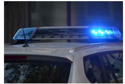
Failing to prepare may result in you preparing for prosecution!