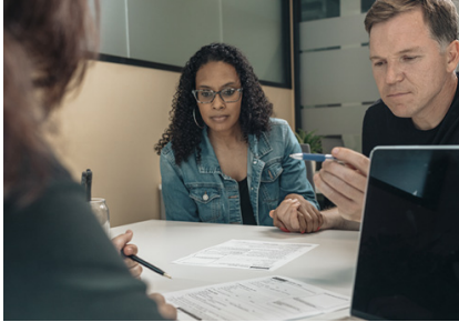
Dealing with the Estate of Someone who has Passed Away