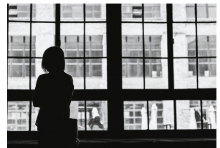
Residence Requirement - Watch Out for Indirect Discrimination