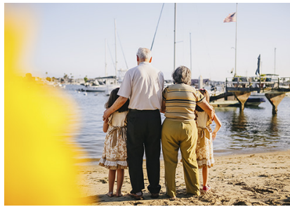
Special Guardianship and Kinship Care