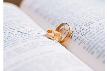
Legal Age of Marriage to rise to 18 in England and Wales - What this means?