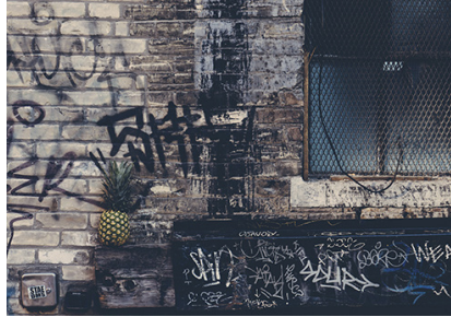
The Government's Anti Social Behaviour Action Plan