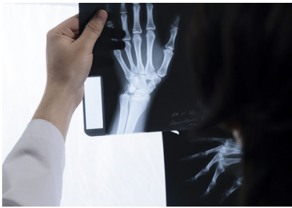
A Step by Step Guide to Personal Injury Claims