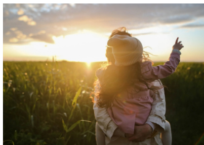
Care Proceedings - Practical Tips for Clients