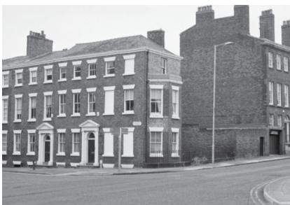
MSB's Social Housing Highlight